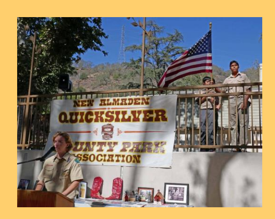
Boy Scout Troop 290

The fabulous Stargeezers entertained us with a delightful mixture of musical genres and humor. They were a lot of fun and perfectly complimented our event.