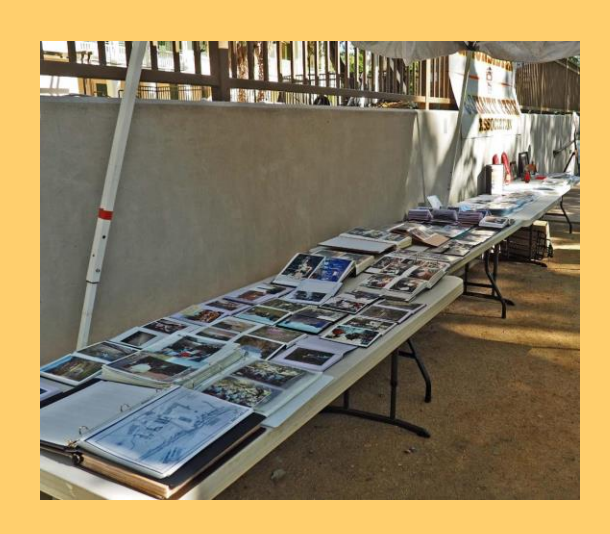
40 years of NAQCPA photos